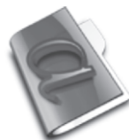
Various Character Sets